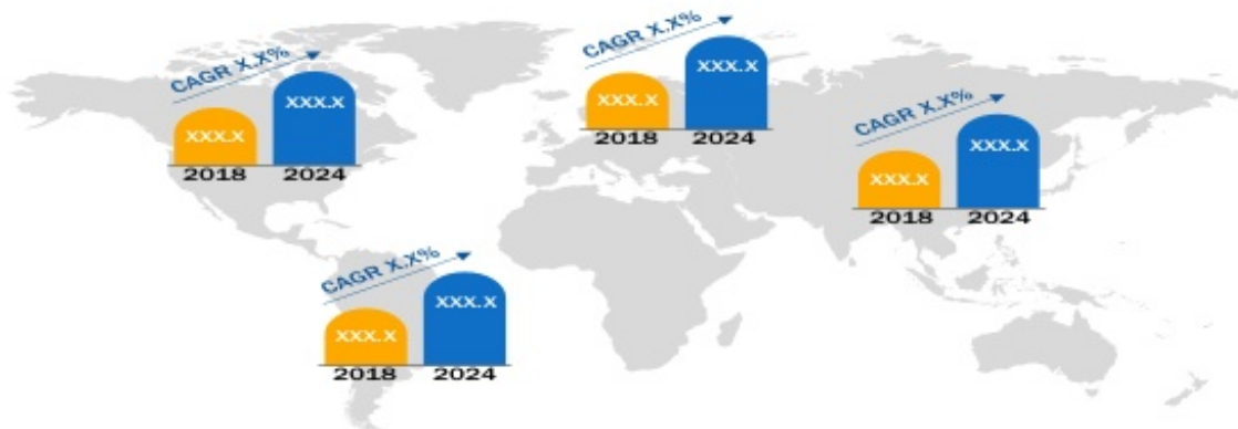
GLOBAL WINE MARKET, CAGR (USD MN) GROWTH BY REGIONS (2018 – 2024)

Wine market is expected to experience rapid growth globally. The global wine market is driven by factors such as increasing demand for low-alcohol content beverages, rising consumption of red wine among females, expansion of bars, restaurants and night parties. Furthermore, growing demand from emerging economics as well as health advantage of wine such as low risk of heart diseases over the other alcoholic beverages are expected to escalate the market growth